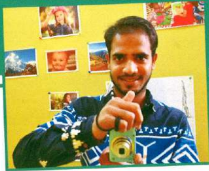
Tauheed Narkeldanga, Kolkata

"If this story brings a smile to your face, take a selfie!"