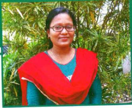
Suprabha Midnapore (East), West Bengal

“My parents received a marriage proposal for me, but I flatly refused. First, I want to become an independent individual.”